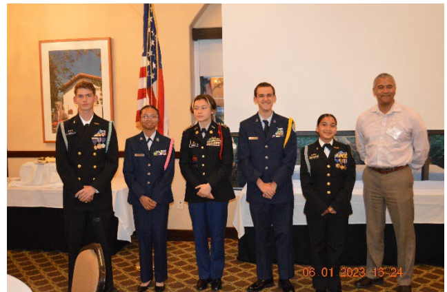
Five of the eight JROTC Cadets Receiving MOAA Medals at their individual ceremonies. These Cadets represented Ramona NJROTC, Mira Mesa AFJROTC, Kearney AJROTC, Scripps Ranch AFJROTC, and Canyon Hills NJROTC.