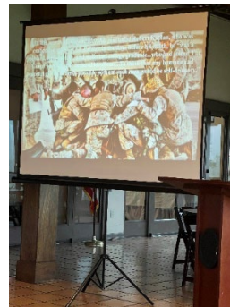
Photo of Guest Speaker and Uncle who developed the formation of the Mexico Air Force in WWII.